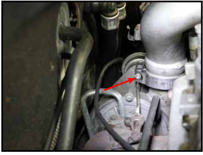
V-band shown here

4 Most applications have a hose clamp that connects the pipe step hose adapter to the turbo. 2004-05 R models use a V-band style attachment that can be loosened with a torx 30.