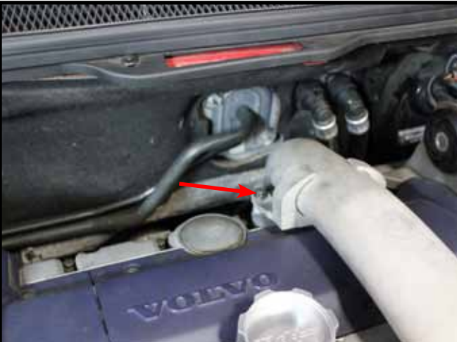
Torx 25 shown 10mm shown

3 Using a long flatblade screwdriver or 7mm socket wrench, loosen the hose clamp that attaches the elbow hose to the intercooler.